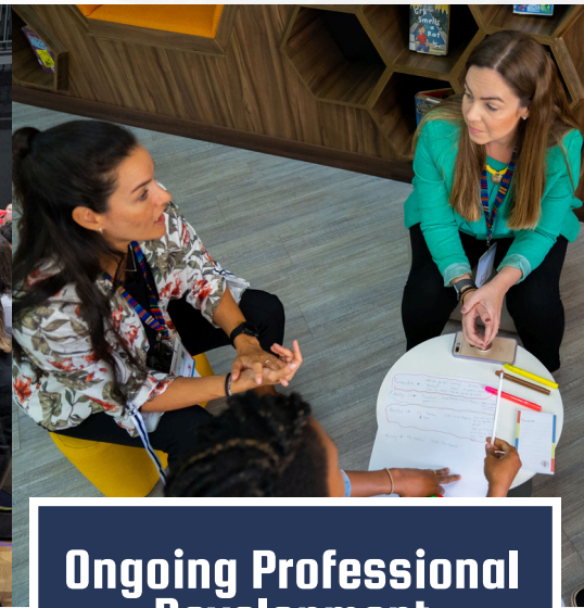
Ongoing Professional Development